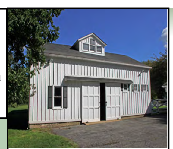
Recognize this building? Visit <u>www.waitehilloh.gov</u> to enter the "Picture of the Week" contest!

Our second annual Summer Celebration will take place behind Village Hall from noon to 2:00 p.m. on Sunday, July 21st. Those of you who attended last year can attest that it is an enjoyable event and opportunity to promote